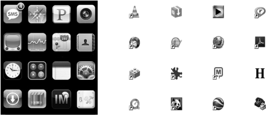
Fig. 1. Example for icon list on a mobile phone (left: Apple ® iPhone icons) and on the computer screen (right: Microsoft Windows ® desktop icons)

or not. Fig. 1 shows examples of typical icon lists. The left icons are very similar because they share the rectangle shape. The right icons have different shapes but they are often rather small on laptop displays. Accordingly, the task to find a particular icon within these lists might be hindered. Users may facilitate their search of relevant icons by classifying and sorting them according to different purposes. However, this method can become rather time consuming depending on the number of icons. Here, another method is suggested that might facilitate user's search by applying a mechanism found in psychological research.